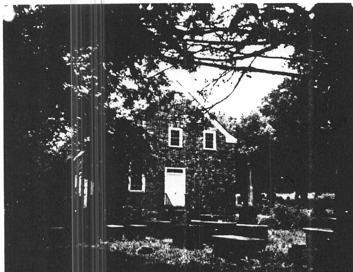
"OLD BRICK CHURCH"